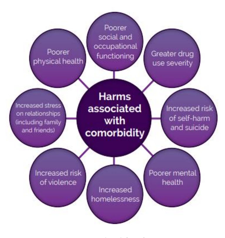
Figure 1: Harms associated with co-occurring substance use and mental health issues