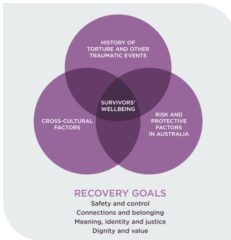
Figure 1: VFST's trauma recovery conceptual framework

This trauma recovery framework guides our work with survivors of torture and trauma and assists our multi-disciplinary team of staff to use consistent practices based on common understanding, drawing on the strengths of different professional disciplines. The framework generates a shared vision across the entire organisation, regardless of specific program areas or work roles.