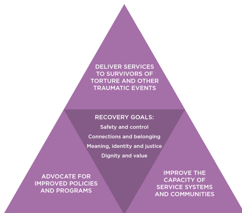
Figure 2: VFST's integrated trauma recovery service model

The emphasis on integration is designed to maximise expertise and effectiveness across the organisation and to create a dynamic and rigorous approach to this field of work. VFST has capitalised on the value of this integrated approach to influence the direction of government policy and programs in the field of refugee settlement and, wherever possible, the treatment of asylum seekers. This integrated model is reinforced by a strong agency operations area which provides financial planning and management services, Human Resource services, IT capabilities and administrative infrastructure.